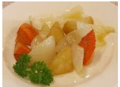
340 FRIED VEGE RM 4.60