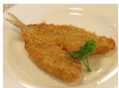
329 KISU FRY RM 6.00