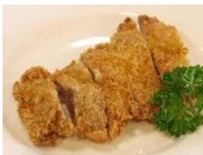
324 CHICKEN KATSU RM 6.80