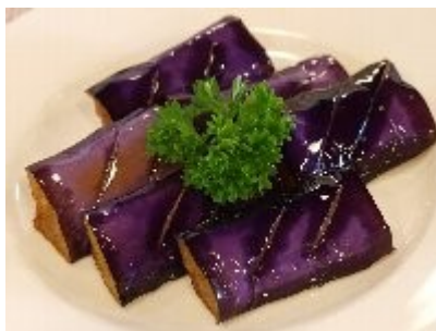
327 NASU RM 4.00