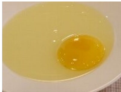
339 EGG RM 3.00