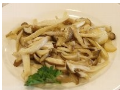
328 MUSHROOM RM 4.80