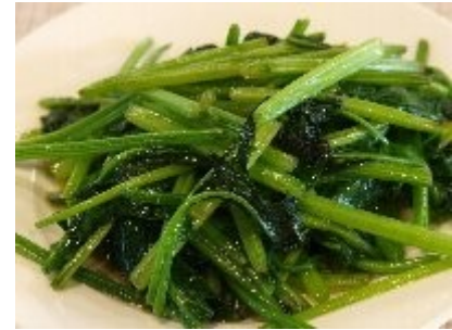
337 HORENSO RM 4.00