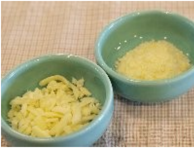
330 CHEESE RM 3.00