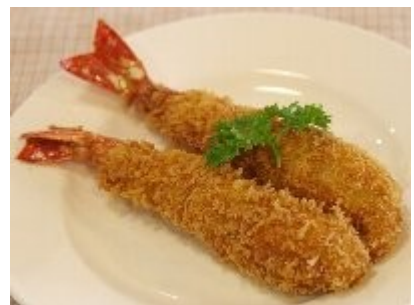
323 EBI FRY RM 7.00