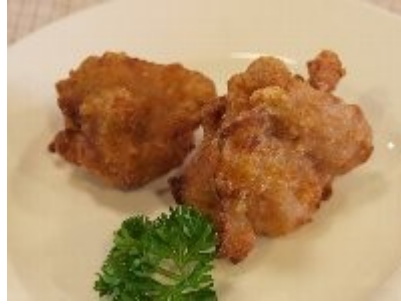
333 TORI KARA RM 5.00