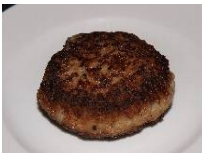
341. Beef Hamburg RM 7.00