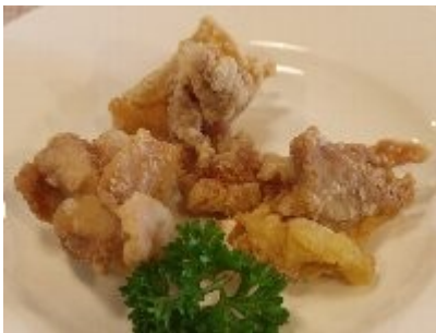
321 CHICKEN RM 4.00