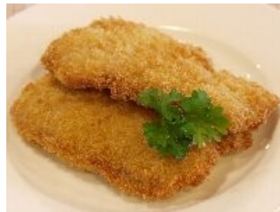
325 PORK KATSU RM 7.80