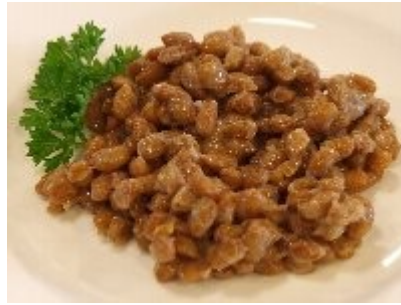
336 NATTO RM 5.00