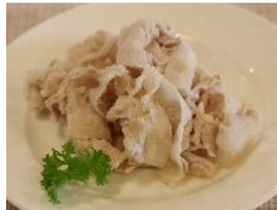
322 BUTASHABU RM 6.00