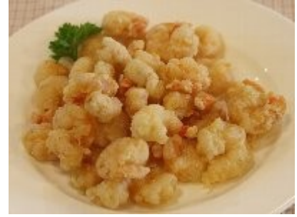
334 EBI KARA RM 5.80