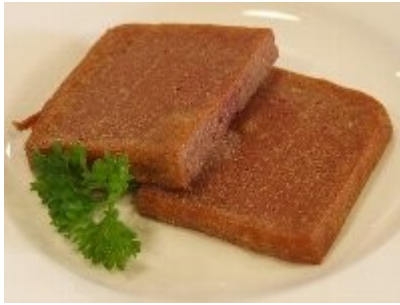
335 PORK CAN RM 4.90