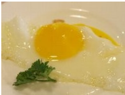
338 FRIED EGG RM 4.60