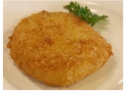
326 CROQUETT RM 5.80